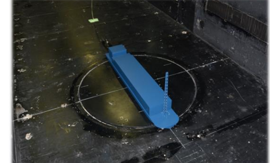
Wind Tunnel Test